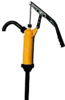
POLYPROPYLENE LEVER STYLE PUMP Model NS375