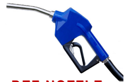
DEF NOZZLE Stainless Steel with Swivel Auto Shutoff Model 510COMSSNOZZ