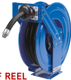
DEF REEL 3/4" x 50' Model HR50 Hose