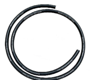
3/4" DEF HOSE Order by the Foot