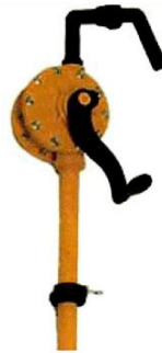
POLYPROPYLENE ROTARY PUMP Model NS10211