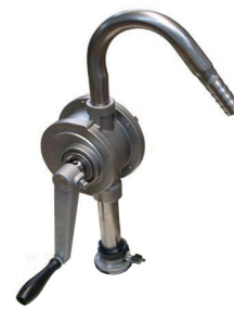
STAINLESS STEEL ROTARY PUMP Model NS11219