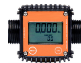
FLOW METER ASSEMBLY Model FMA